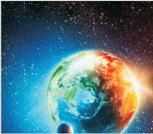
Earth- the most valuable realestate in the solar system.

Key Words: clean-up of planet, minimise waste, protect water quality.